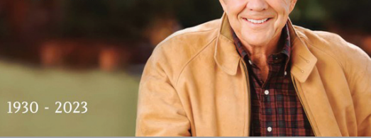
Marion Gordon "Pat" Robertson

many times, "I was just an unworthy servant and have only done my duty. The Lord did it all, not me."